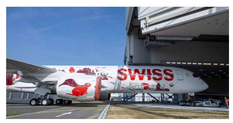
The Airbus A350 in its 'Wanderlust' livery