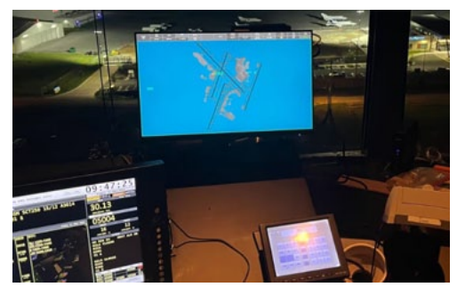
Saab will equip 26 more U.S. airports with its Aerobahn Runway and Surface Safety service $@ Saab

The Federal Aviation Administration (FAA) has awarded Saab a significant contract to install its Aerobahn Runway and Surface Safety service at 26 additional airports across the United States. This award falls under the FAA's Surface Awareness Initiative (SAI) Block 3 deployment, furthering efforts to enhance runway safety through modern, technology-driven solutions. Saab's system is designed to increase situational awareness for air traffic controllers by accurately tracking air-