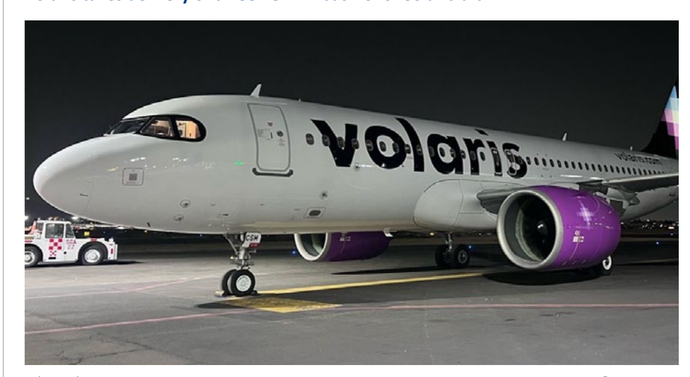
Volaris Airbus A320neo