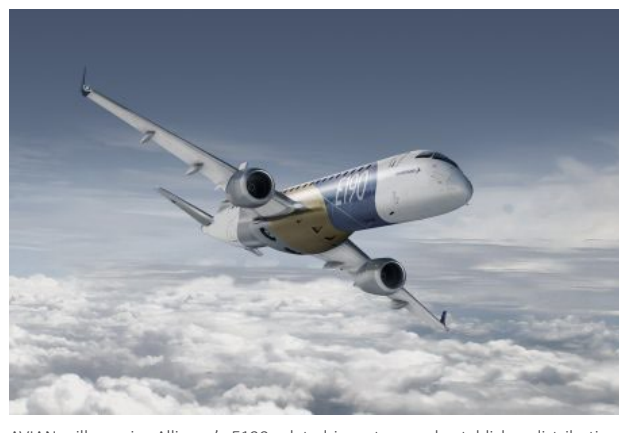
AVIAN will acquire Alliance's E190-related inventory and establish a distribution centre in Brisbane

AVIAN Inventory Management (AIM), a bespoke provider of inventory capital solutions and financier to the aviation industry, has announced a new partnership with Alliance Airlines in Australia. Alliance is a regional carrier supporting wet lease and charter operations for the energy and resources sectors, along with sports and entertainment charters. Under the agreement, AVIAN will acquire Alliance's E190-related