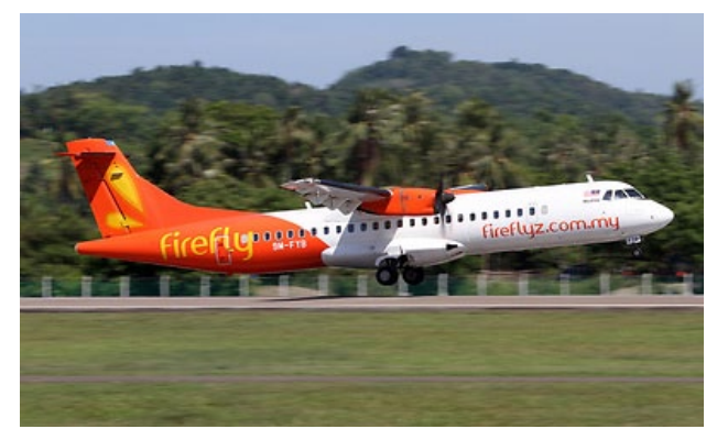
Firefly ATR 72-500 aircraft