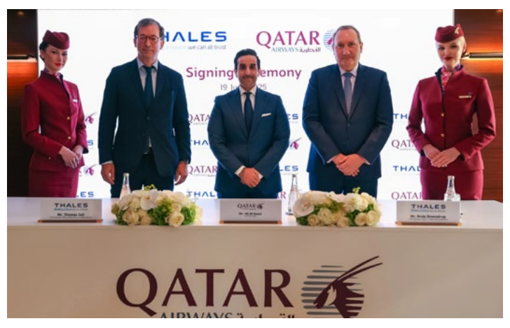
The newly signed MoA between Thales and Qatar Airways is the foundation for future innovation in inflight entertainment (IFE)

Thales has signed a memorandum of agreement (MoA) with Qatar Airways to support the airline's latest strategic fleet expansion. The agreement sets a foundation for future innovation in inflight entertainment (IFE), aligned with Qatar Airways' digital transformation goals. The MoA also outlines plans to explore the development of a dedicated IFE service and maintenance centre in Doha. This facility would provide localised support for Qatar Airways' growing fleet, offering repair services, spare parts distribution, technical support, and turnkey maintenance for the full range of Thales IFE systems. It is intended to operate with the highest levels of efficiency and responsiveness. This partnership builds on a longstanding relationship between the two companies. Thales has already equipped Qatar Airways aircraft such as the Boeing 787-8 Dreamliner and the Airbus A350 and A380, with IFE solutions. The collaboration was recently extended to include the airline's new Airbus A321 NX fleet, which will be fitted with Thales' FlytEDGE cloud-native IFE platform. In addition to enhancing passenger experience, this partnership supports the broader objectives of Qatar Vision 2030 by contributing