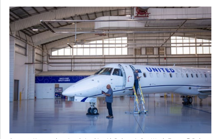
CommuteAir strengthens its relationship with Embraer in Fort Worth, Texas © Embraer

CommuteAir, a regional airline operating as a United Express partner, and Embraer have signed a significant maintenance contract. The new agreement marks a major development in CommuteAir's operational strategy, as it strengthens its relationship with Embraer while ensuring enhanced maintenance support for its fleet of