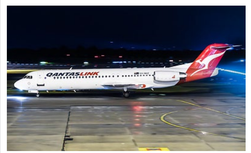
QantasLink will replace its ageing F100 planes with Embraer E190 jets