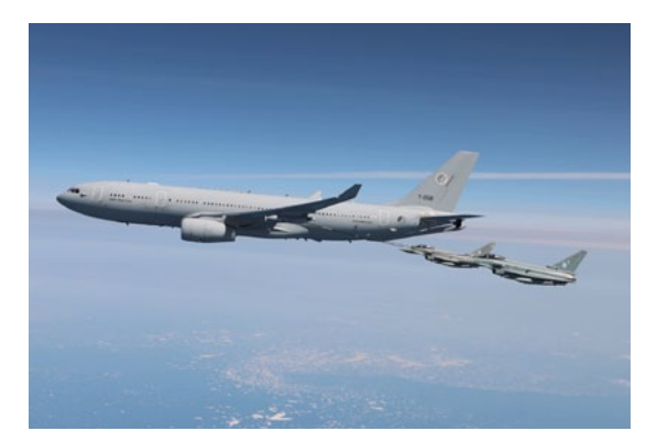
Airbus A330 MRTT aircraft