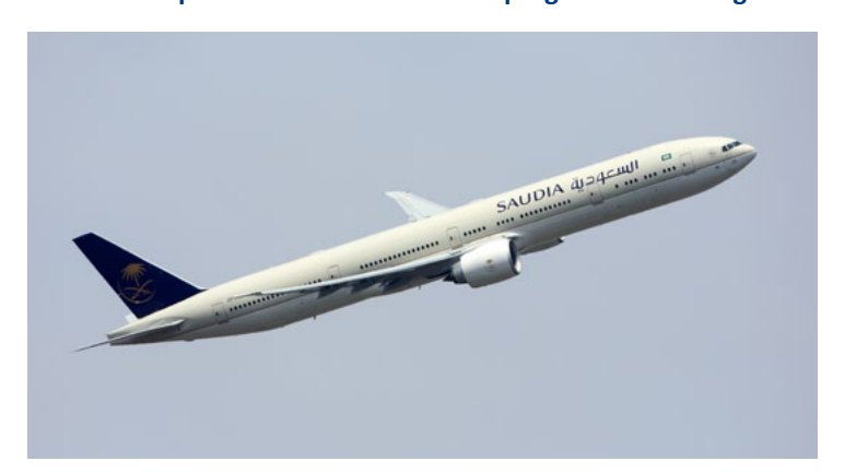
Saudia Group Boeing 777