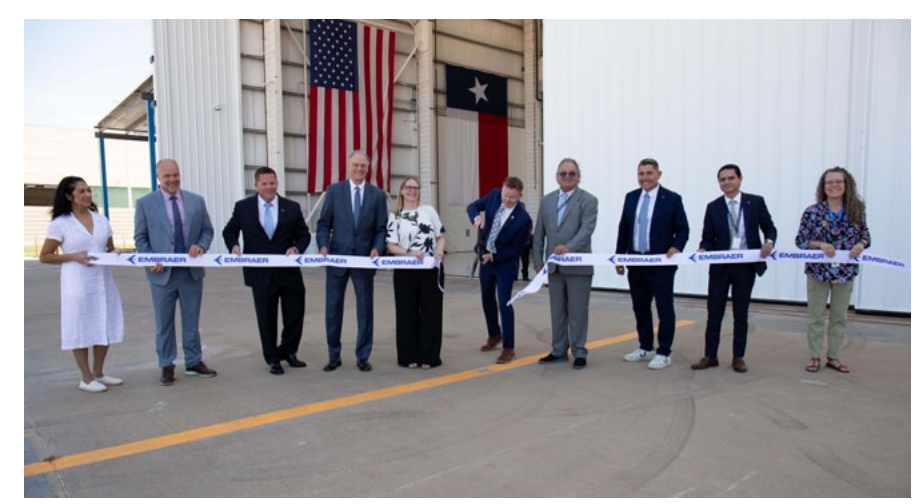
Official opening of the new Embraer Dallas Fort Worth MRO facility